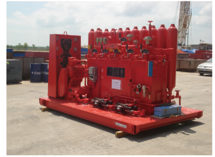
BOP CLOSING UNIT SPECIFICATIONS

TFI BOP closing units range in a variety of sizes. These units come standard with air/electric over hydraulic design but can also be delivered as a diesel driven setup. HMI control package is available as option.