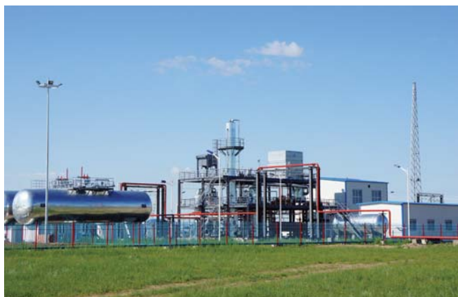
CO 2 Flooding Station for Enhanced Oil Recovery (EOR)