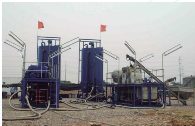
Treatment Equipment of Oil-bearing Sludge (or Wastewater)