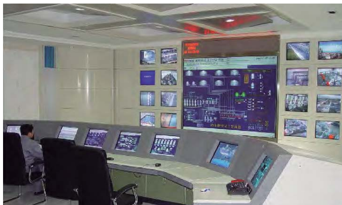
PLC Automation System of CPF