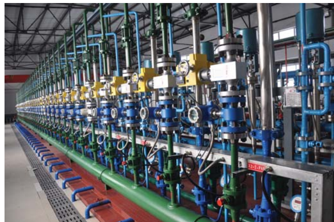
Polymer Flooding Station for Enhanced Oil Recovery (EOR)